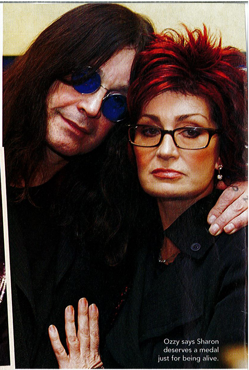
Ozzy says Sharon deserves a medal just for being alive.