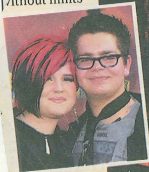
Sharon and Ozzy Osbourne with kids Kelly and Jack

and iron heat ear- old hat TV's have shown without limits