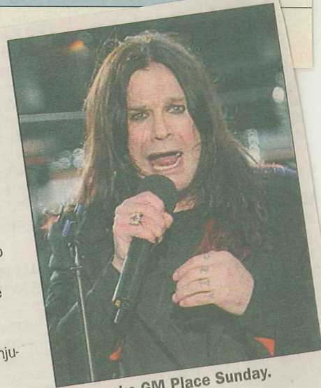
Ozzy rocks GM Place Sunday.

Pentangle, along with Steeleye Span and Fairport Convention, founded the remarkable British folk-rock movement in the late ’60s. Pentangle’s master guitarist John Renbourn and entrancing singer Jacqui McShee appear at WISE Hall, Sunday.