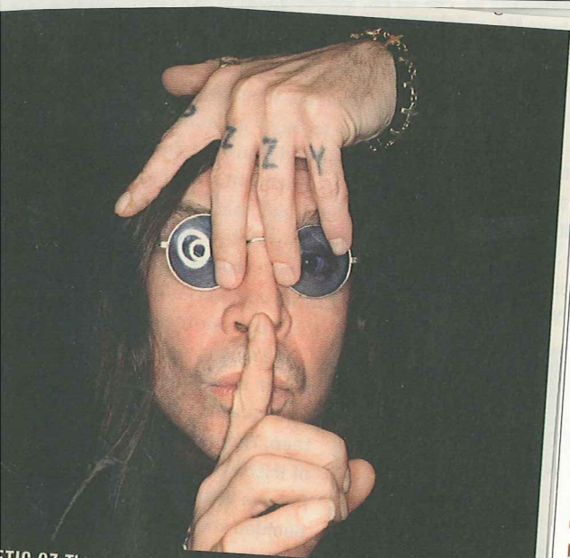
ETIC OZ The maestro of metal prepares to blow these nii kids away