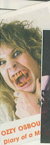
OZZY OSBOURNE Diary of a Madman

Le 5 mars, le réseau MTV diffusera le premier «reality show de situation» de l'histoire de la télé en présentant The Osbournes . Cette tragicomédie familiale mettra en vedette le rockeur Ozzy Osbourne — père, star et mangeur de souris —, qui joue son propre rôle aux côtés de sa femme, Sharon, et de deux de ses adolescents. The Madman ne change pas de carrière pour autant: il est toujours très actif au sein du groupe Black Sabbath.