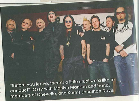
"Before you leave, there's a little ritual we'd like to conduct": Ozzy with Marilyn Manson and band, members of Chevelle, and Korn's Jonathan Davis