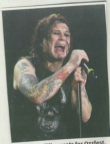
ing trouble filling seats for Ozzfest.