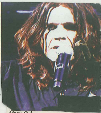
Ozzy Osbourne says goodbye to life on the road.