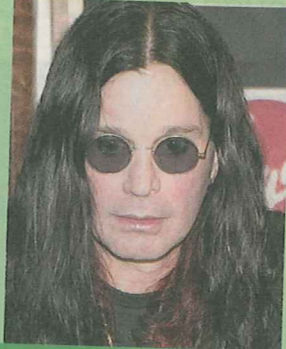
Ozzy Osbourne

Ozzy Osbourne has been diagnosed with Parkin Syndrome, not to be confused with Parkinson's disease.