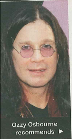
Ozzy Osbourne recommends ▶

REMEMBER WHO? Rock star Ozzy Osbourne walked into a CBS records marketing meeting, pulled out a dead dove, and bit its head off. "I wanted them to remember me," he said.