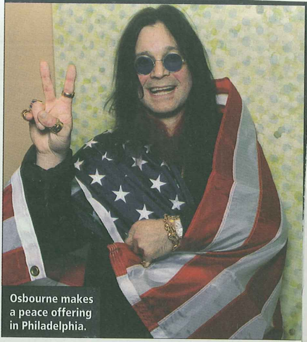
Osbourne makes a peace offering in Philadelphia.