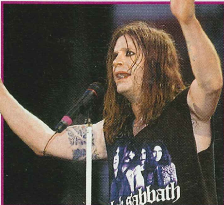
Ozzy performing in the late 1990s.