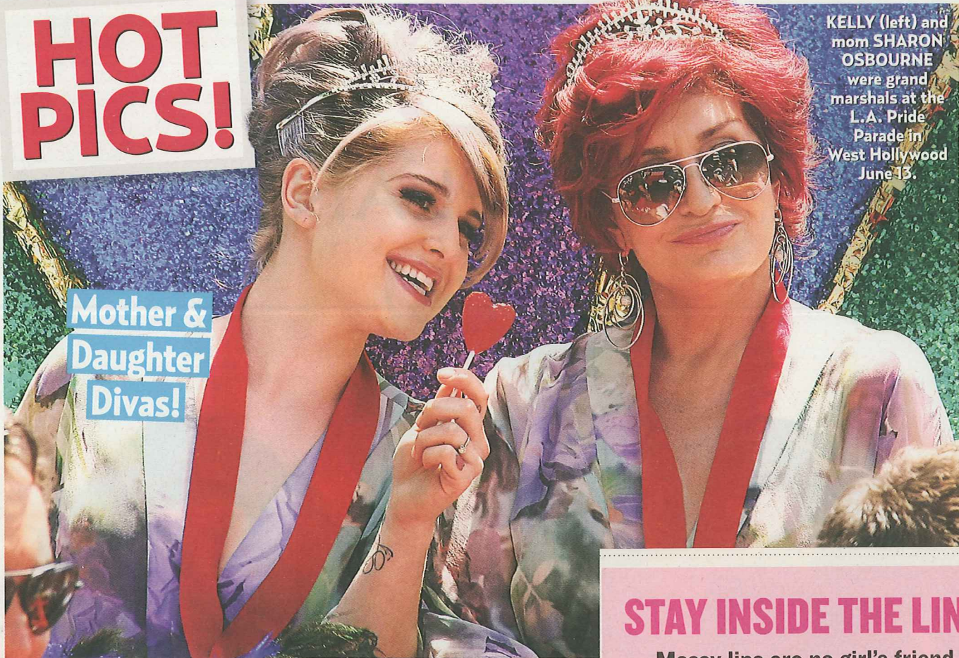
KELLY (left) and mom SHARON OSBOURNE were grand marshals at the L.A. Pride Parade in West Hollywood June 13.