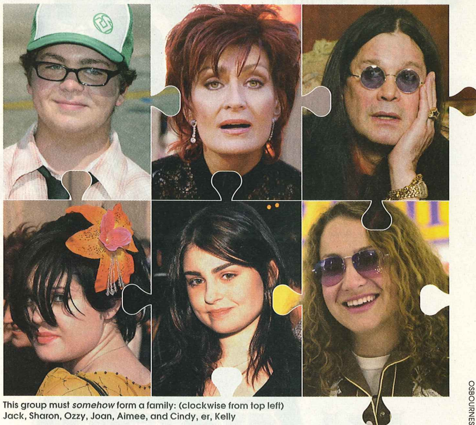
This group must somehow form a family: (clockwise from top left) Jack, Sharon, Ozzy, Joan, Aimee, and Cindy, er, Kelly