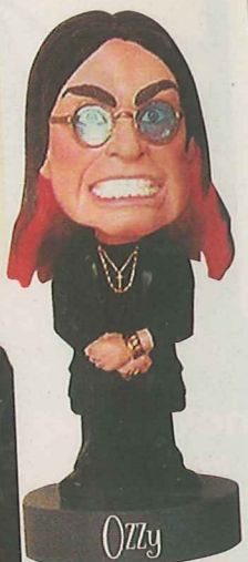
The talking Ozzy Osbourne bobblehead barks out catchphrases like, "I love you all, but you're all f***ing mad!"