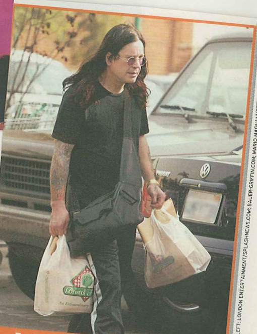
Rocker Ozzy Osbourne carries his own groceries out to his BMW.