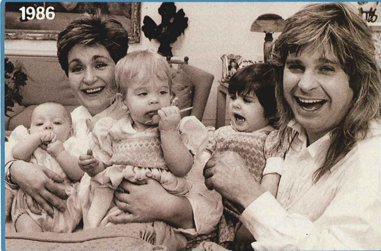
Anyone who watches The Osbournes knows Ozzy as a devoted father. "A rock star is supposed to say, 'Run me a bath in Perrier water,'" he says. "I get dog [poop] up to the elbows and an earful of abuse."