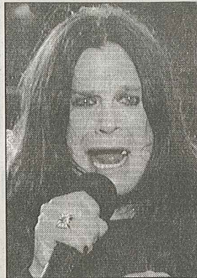
■ OZZY OSBOURNE

A PLAN to give wild man of rock Ozzy Osbourne the freedom of his Birmingham birthplace has split the community where he once lived.