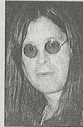
■ MOVE: Ozzy

The former Black Sabbath frontman scored his first number one single last week with daughter Kelly.