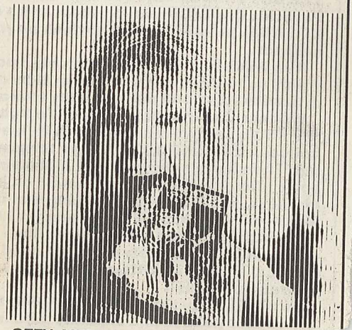
OZZY: METAL maniac

...axis in the last programme of this series.