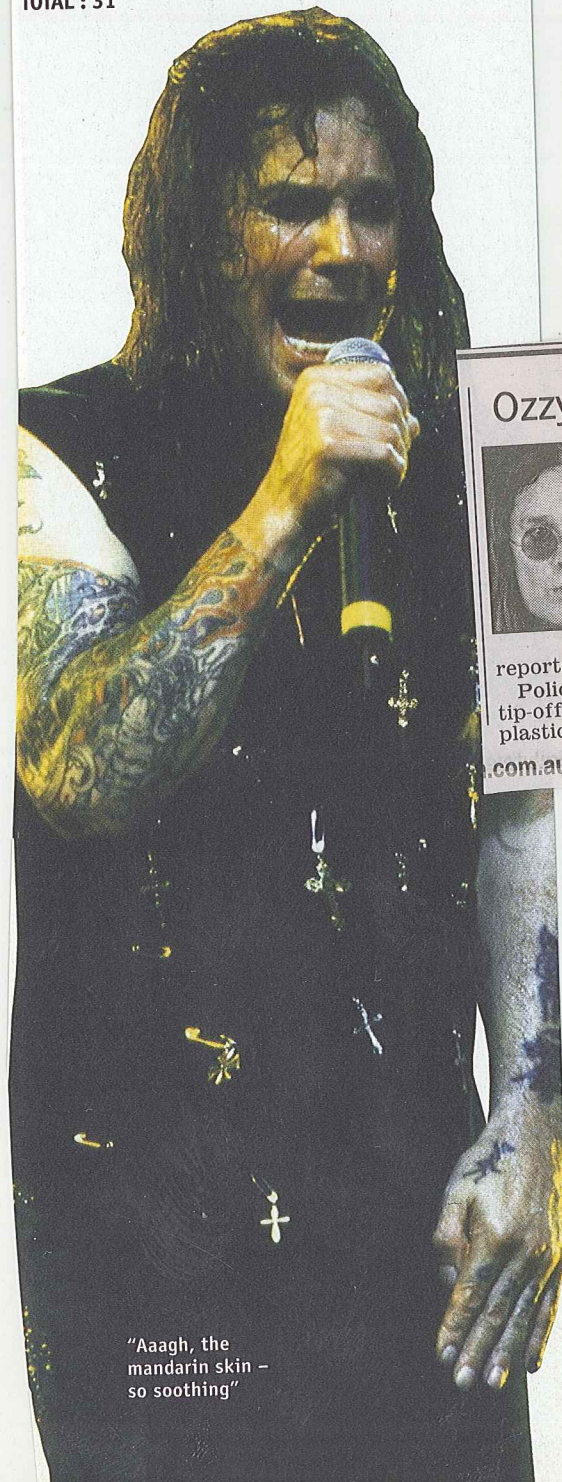
"Aaagh, the mandarin skin - so soothing"