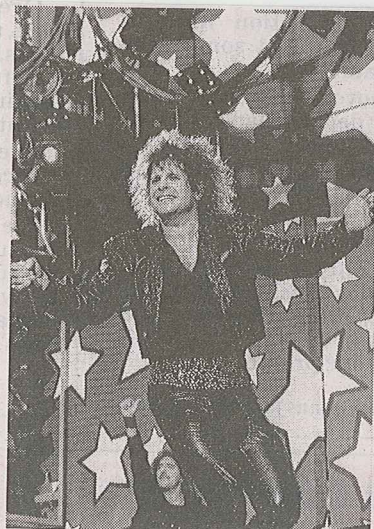
Reality show: Ozzy Osbourne

WE'RE not sure how much of a rocker Karl Stefanovic is but the Today show presenter looked pretty chuffed to meet heavy metal godfather Ozzy Osbourne in London on the weekend. Stefanovic was pre-