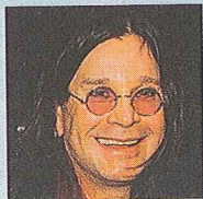
Ozzy Osbourne is 55 on December 3.